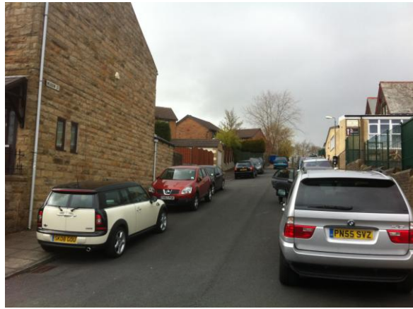
Parking on Meadow Street

The applicant is exploring options for the provision of alternative access arrangements and car parking to address the concerns. The results of this will be reported to the meeting.