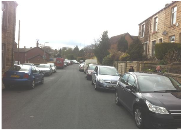
Parking on East Street