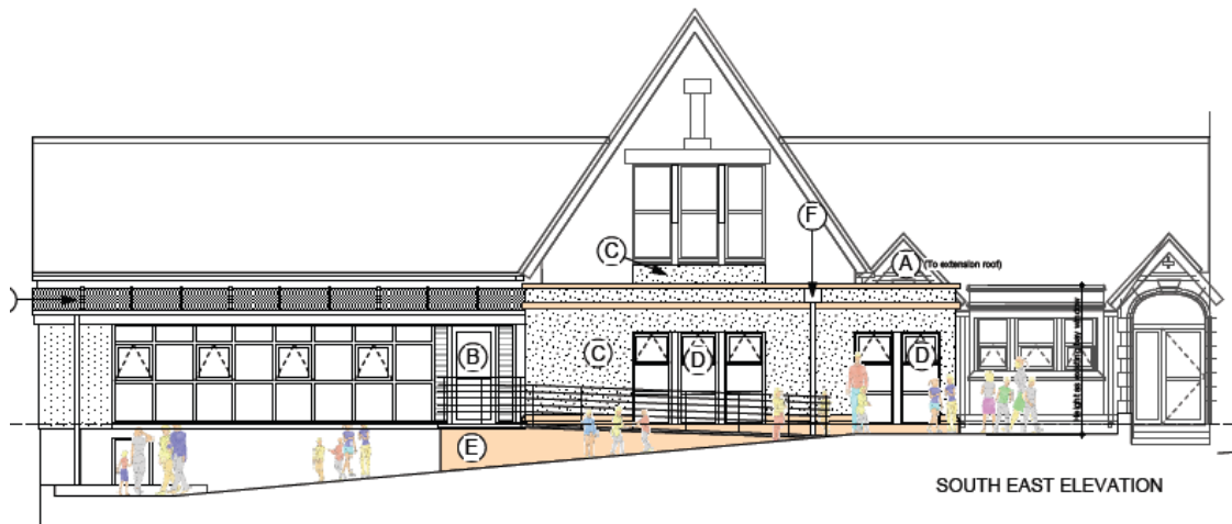
Elevation facing East Street