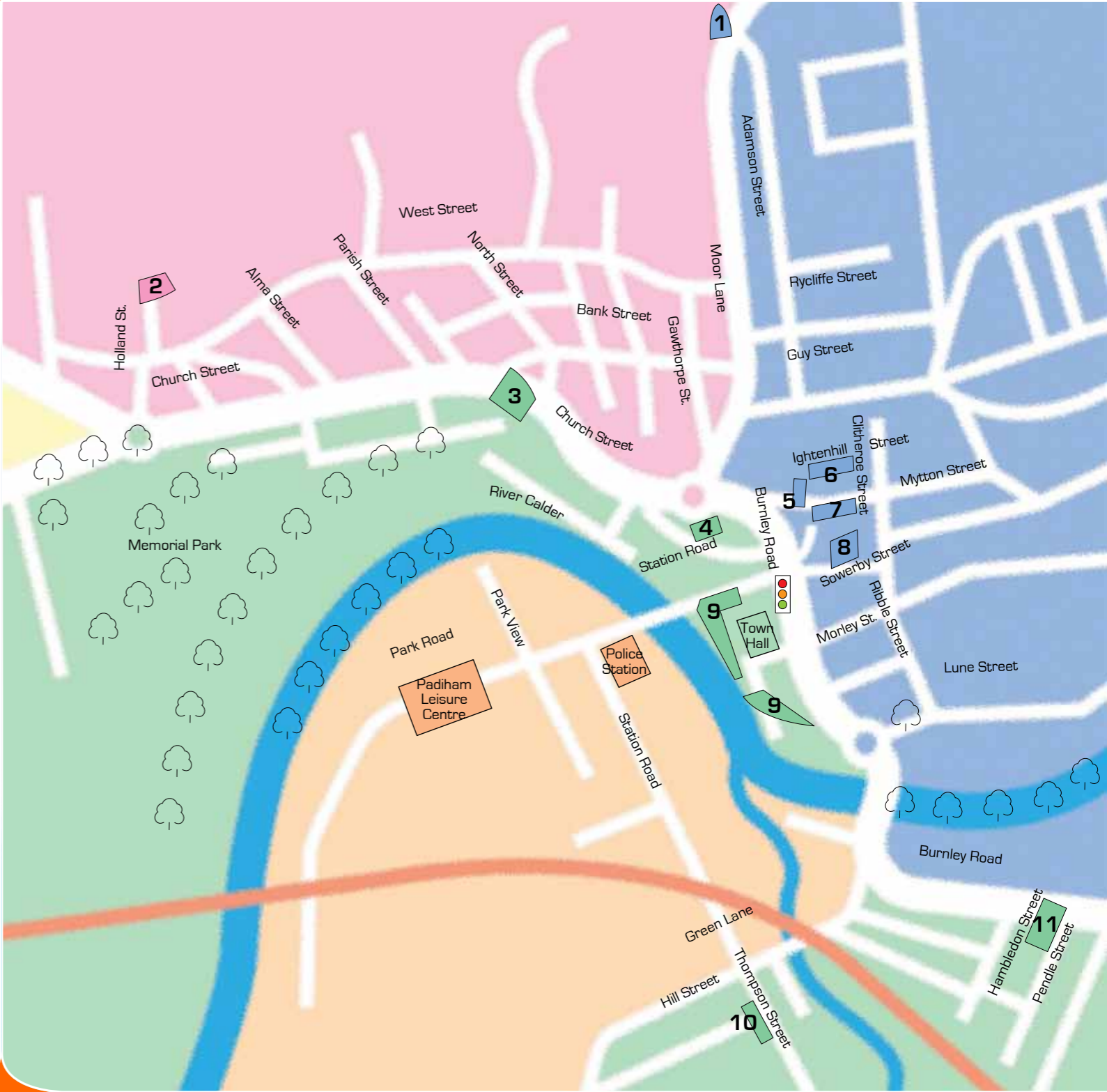
PARKING IN PADIHAM